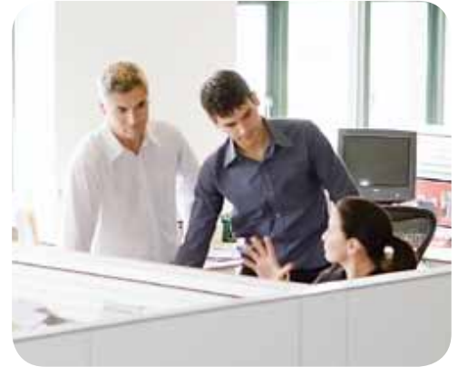
External Print Procurement

Enterprise Print Services offers a comprehensive, enterprise-wide managed print service that integrates all on-site and off-site print environments.